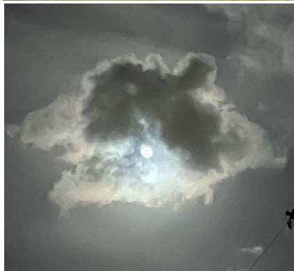
Moon peaking out over Stuart

In this busy world some special people have the art of taking time for others. . .of giving from the heart. Thank you for simply being you.