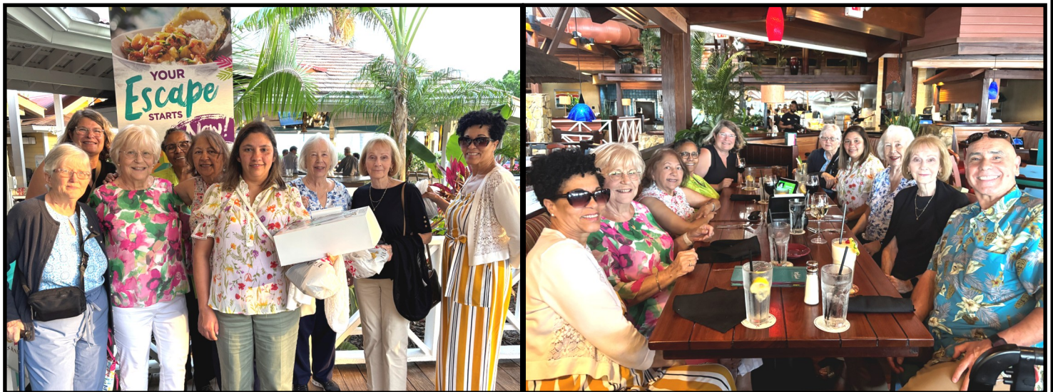
Food Bank Volunteers celebrating the birthdays of Elaine, Maysie and Rita (not pictured). Great time!