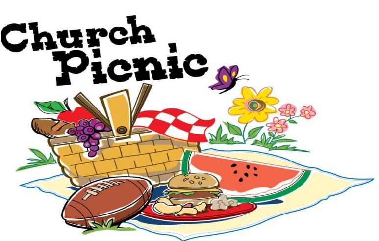
Sunday, October 14, 2018